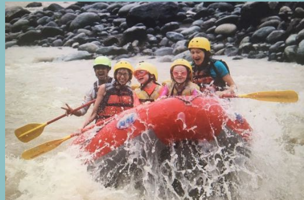
FULL DAY SAVEGRE TOUR

Includes: Guide, all equipment, snacks, and beverages.