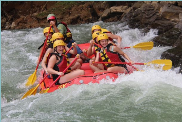
HALF DAY NARANJO TOUR

The Naranjo River drops steeply from the mountains above Quepos offering a thrilling experience for all.